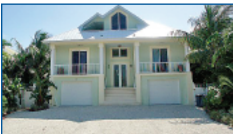
Custom Built Home 2004! CBS w Concrete Roof. 3B/3B 2862sf. Designer interior Door Casings & Trim Moldings, 8' doors. Beautiful Kitchen w SS appl's Granite & fine wood cabinetry. Marble Baths w Glass Showers. 3rd floor M bedroom suite. Panoramic Bayviews from Balcony & Sundeck. 70' deepwater concrete dock, 1.5K Boat lift, 30amp shore power. 2 2 Car Garages. $1,250,000